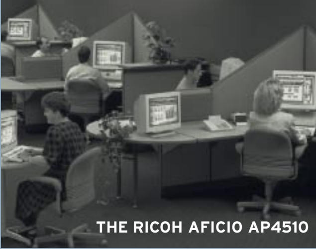
THE RICOH AFICIO AP4510

The laser printer that meets the daily demands of everyone in the department.